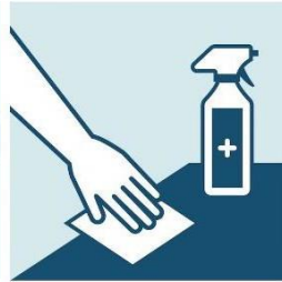
Keep objects and surfaces clean

Call your doctor again if you are getting worse. Call back if you are having trouble breathing. Do what your doctor says.