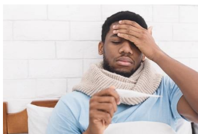
A fever of 100.4° or higher