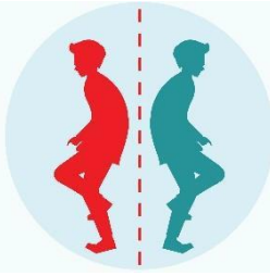
Avoid contact with others