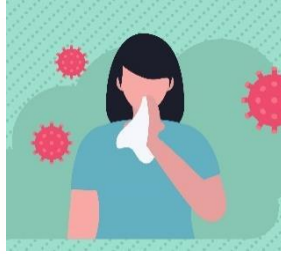
Use tissues, then throw them away